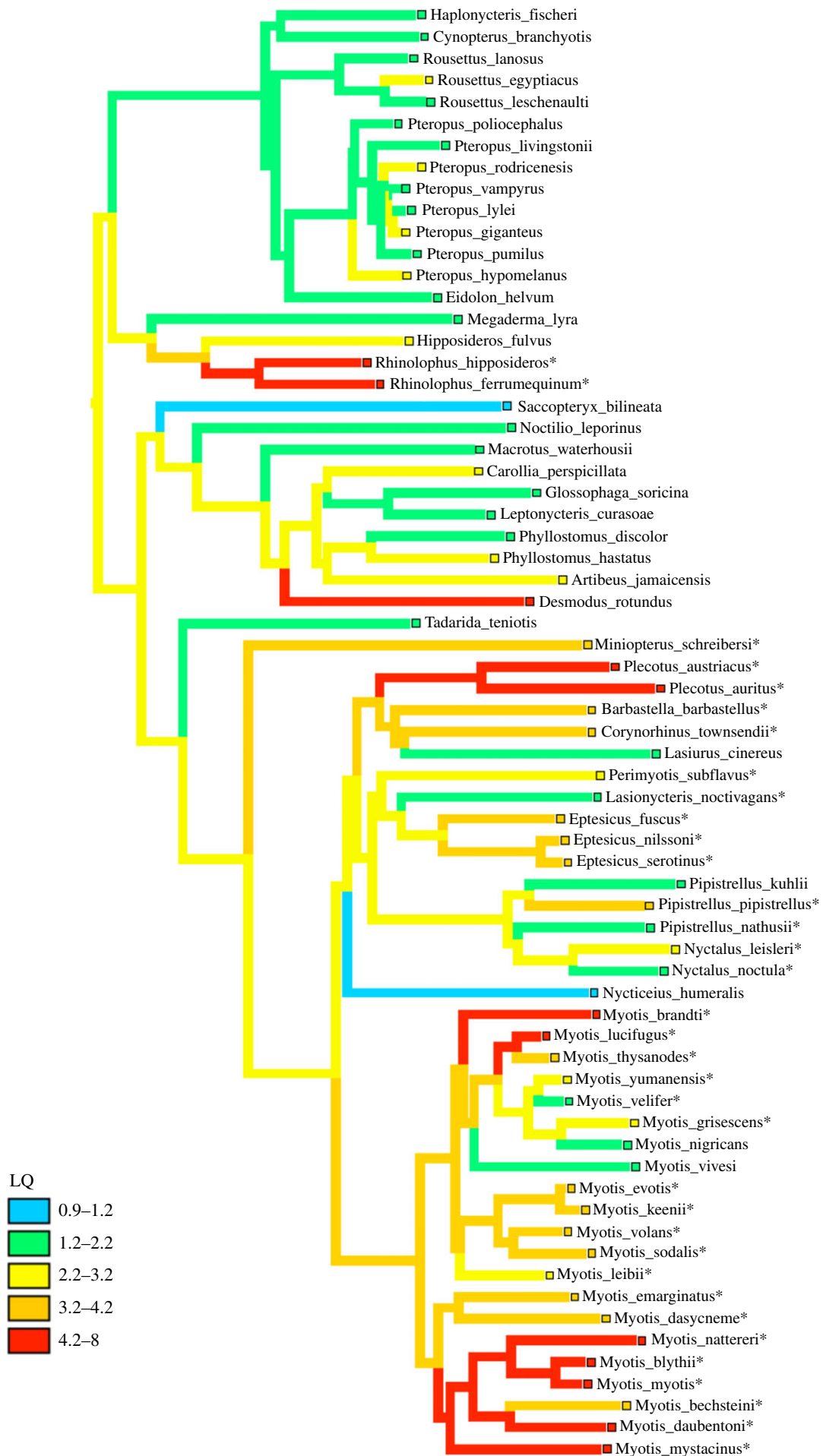
Figure 1. Ancestral state reconstruction by squared-change parsimony of longevity quotient (LQ) for bats, with * indicating hibernating species. (Online version in colour.)